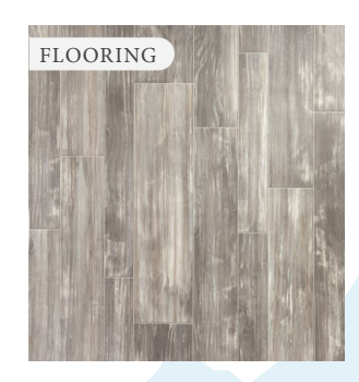
Option Available on Select Floor Plans: