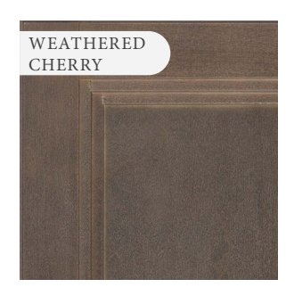
OPTIONAL LUXURY COLLECTION